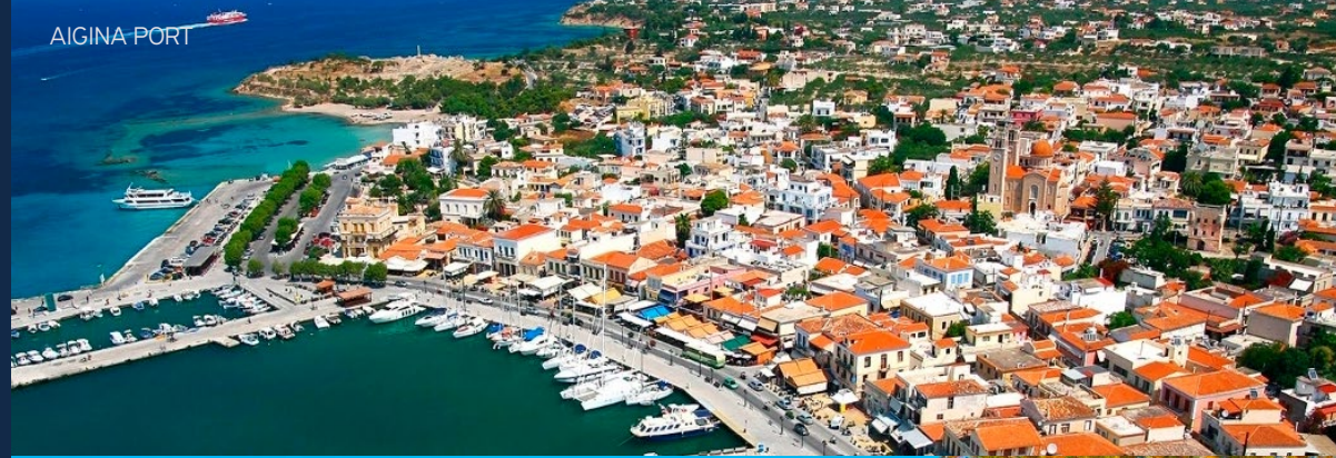
PERDIKA - AEGINA ISLAND

The choice is yours! The return journey starts before sunset and offers us a romantic atmosphere as the sun sets right behind us.